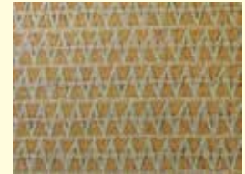
WS85SD 1/16" Knitted Polyethylene Opacity 85 %