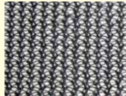
WS70BK 1/8" Knitted Polyethylene Opacity 70 %