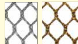
3/8" Knitted Polyester DNR900 Black • DNR850 Gray • DNR500 Sand

RocBloc™ panels are layered and joined together at the border with 75 mm HTPP webbing and then double-stitched with polyester thread. Stainless steel grommets are installed two foot on-center along all sides.