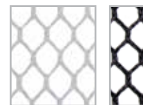
DNR800 FR / DNR900 FR

Call Full Circle Group for all your netting needs at 212-933-9071